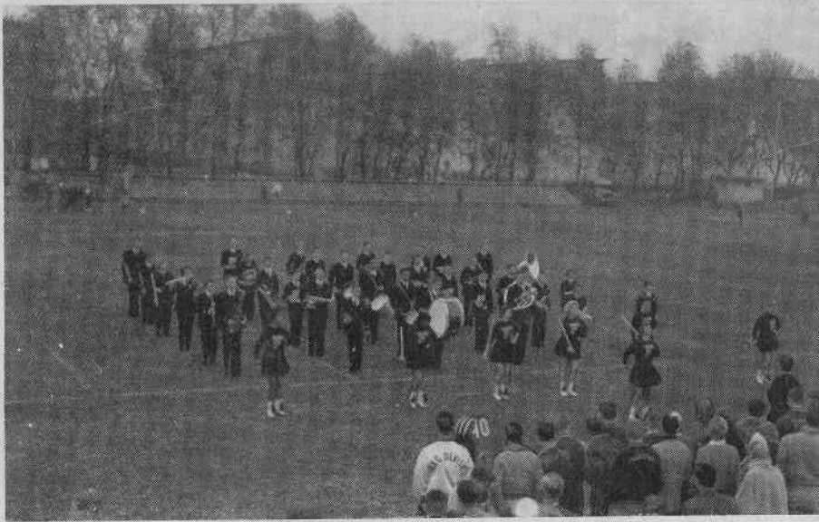
FHS band and Majorettes perform at Frankfurt stadium during '58 football season! They will appear later this year in some of Frankfurt's popular Fasching parades, and several other local events.